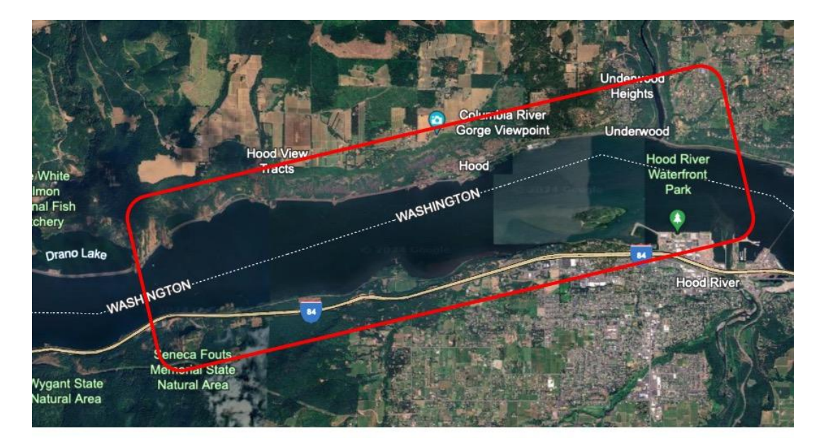
RACING AREA B (Bingen to Chicken Charlie)

RACING AREA A (Event Site to Mitchell Pt.)