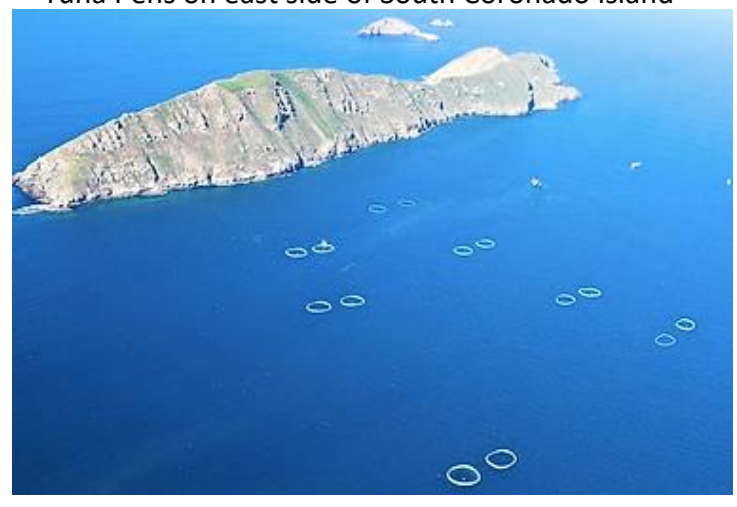
Tuna Pens on east side of South Coronado Island

Tuna Pens may also be located on the west side and at the southern tip.