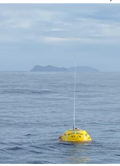
Pt. Loma South Waverider Buoy

Reminder: "Innocent passage" (see NoR 11) means NO fishing activities!