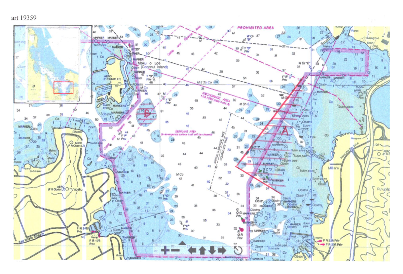
Appendix 1 Chart of Approximate Race Area

Above is a chart of the approximate race area.